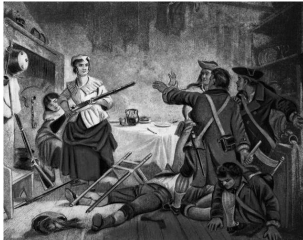
Nancy Hart shot two British soldiers who questioned her for aiding an American Patriot.

2 www.historytools.org/sources/Abigail-John-Letters.pdf