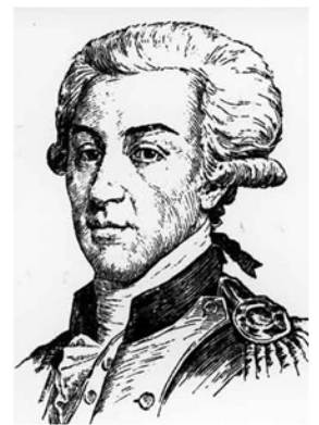
Marquis de Lafayette

Probably the most famous foreign commander during the American Revolution is the Marquis de Lafayette. Born into French wealth and nobility, Lafayette was inspired by the Americans' fight for freedom. In 1777, he volunteered and was commissioned a Major General in the U.S. Army. Lafayette led American troops in four battles. When he returned to France, he petitioned his government to support the American cause with money and troops. "This lobbying in Versailles may have been his greatest service to the United States as it helped tip the balance in favor of sending a French army in 1780 under the command of General Rochambeau." 1