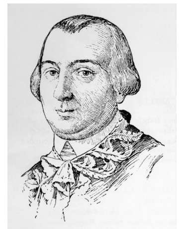
Bernardo de Gálvez

Gálvez commanded his own forces as a General in the Spanish army. The Continental Marines who participated in the Battle of Mobile served under his command, thus being the first U.S. troops to serve under a foreign command. That it happened under Gálvez reinforces his special connection with the United States of America and its war for independence.